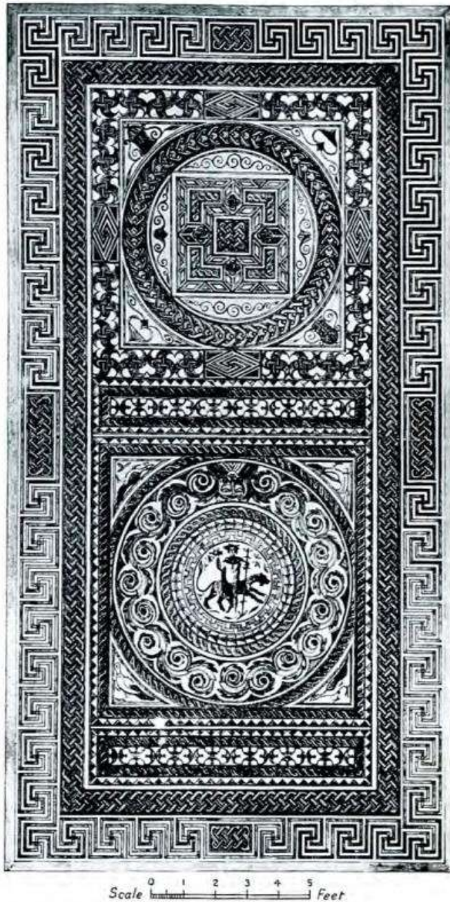
STONESFIELD, OXON. : mosaic pavement found 25 January, 1712.

Fig. 3. The only copy on paper of an engraving reproducing the mosaic found at Stonefield in January 1712. 9