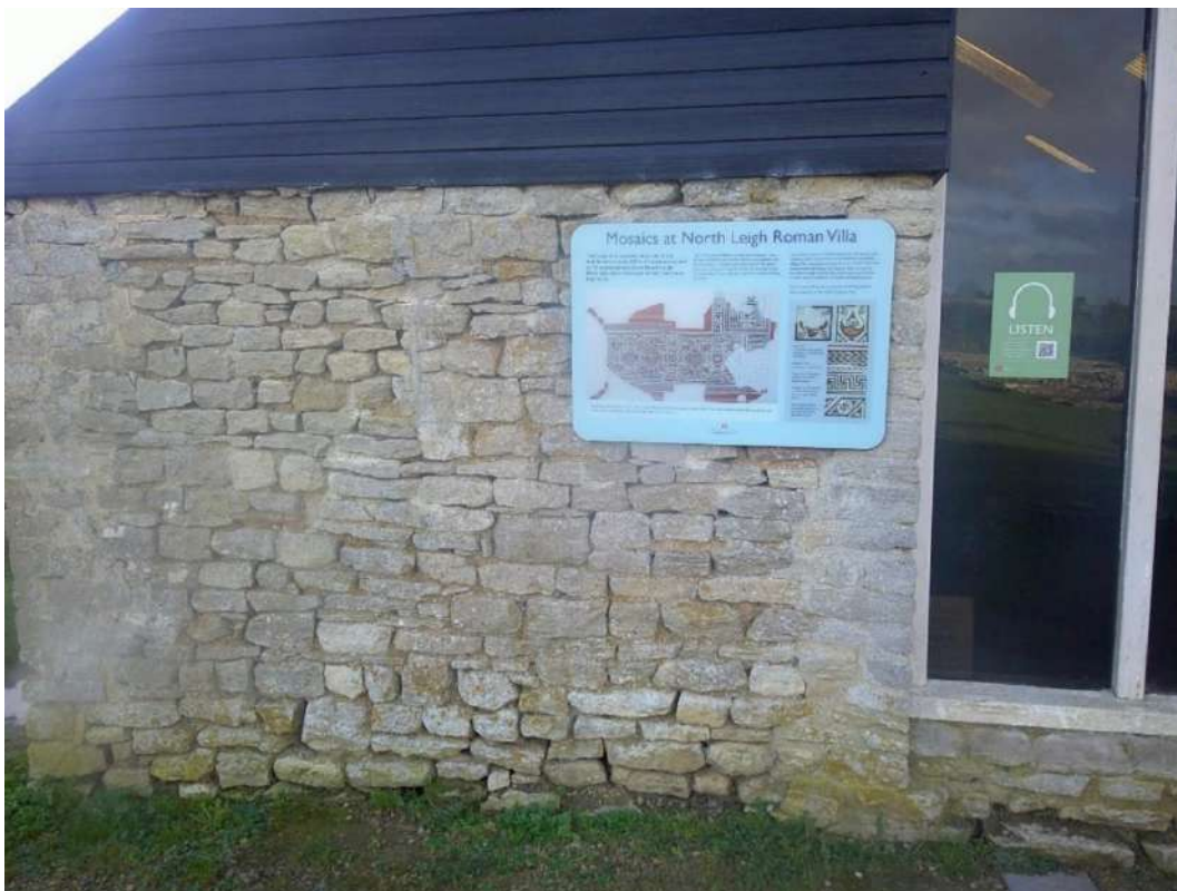
Fig. 8. The building that protects the mosaics; photo EED-V, 13 th of November 2023.

Today the piece is hosted by a large solid shed built for this purpose initially by the Duke of Marlborough in 1816 and renovated from time to time since, fig. 8 (2023).