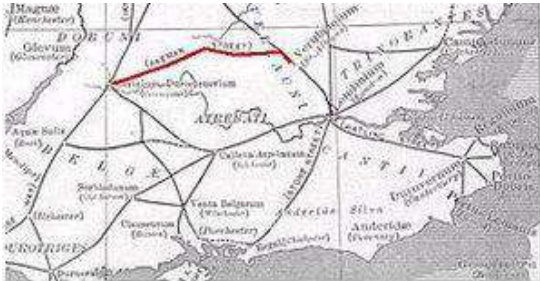
Fig. 1. Roman roads in south east England; Akeman Street, between the north of Verulamium and the Fosse Way at Corinium Dobunnorum is marked in red.

Today from Oxford the villa can also be approached following the itinerary shown on the map in fig. 2 .