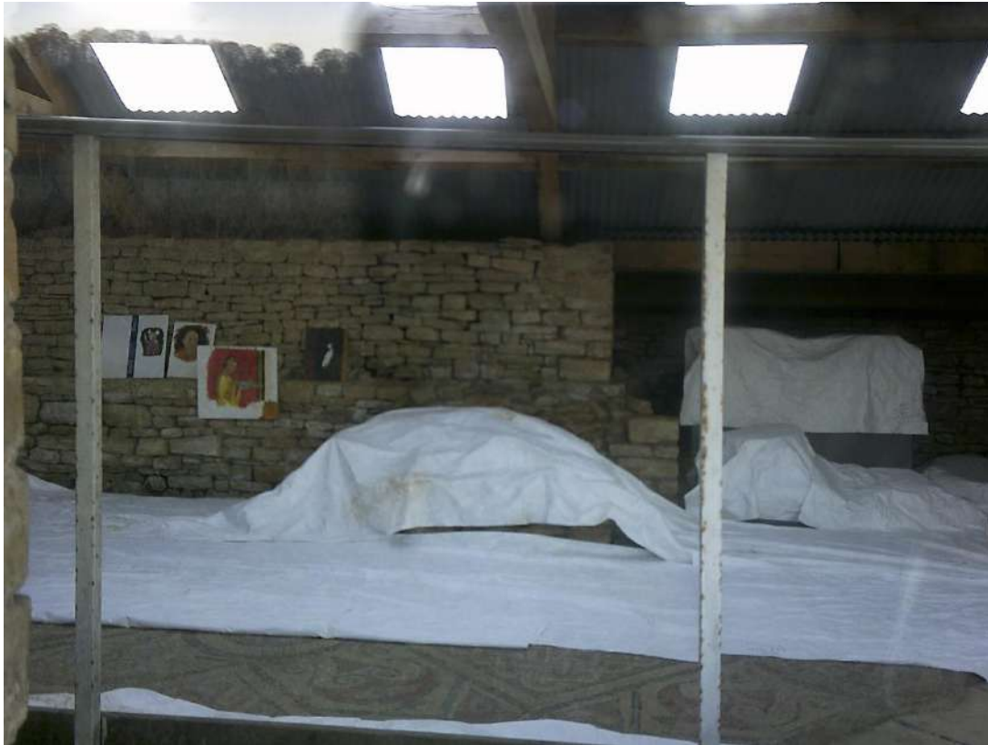
Fig. 11 b. The work for the protection and conservation of the pavement mosaic at the North Leigh Roman Villa; photo EED-V, the 20 th January 2025.