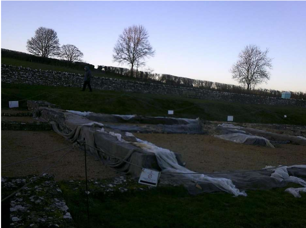
Fig. 6 c. Remains from the villa in January 2025