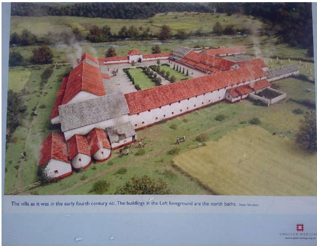
Fig. 6 a. The contemporary to us model of the original Roman Villa at North Leigh; photo of the image on the site EED-V, 10th September 2023.