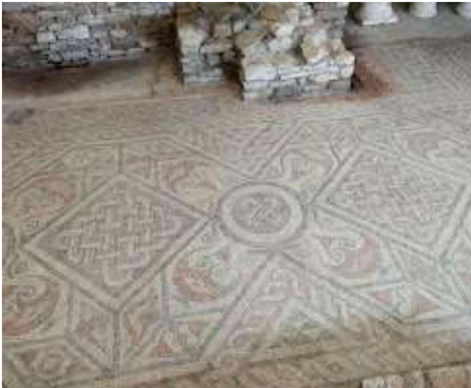
Fig. 7 a. The well mosaics preserved at North Leigh Villa, 13th November 2023.

As I mentioned above, at least 19 mosaic floors existed in the ‘courtyard’ of the Roman Villa in North Leigh, where the archaeologists have identified 60 rooms. 30 These pavements protected the heating system under them and formed a part of the decoration of the house. What has survived until now consists in a well-preserved mosaic pavement, which decorates the floor in what the archaeologists assigned as Room 30, fig. 7a, b . 31