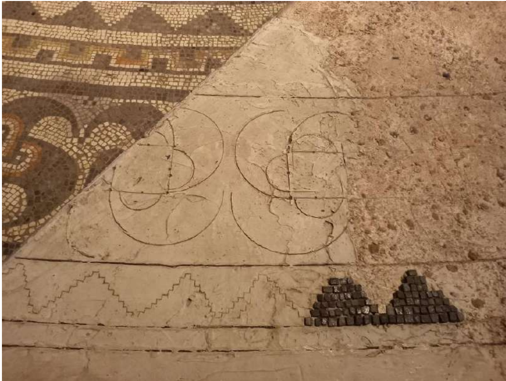
Fig. 10. Stage within the re-creation of the missing sections of the mosaic at the North Leigh Roman Villa; photo EED-V, 13 November 2023.