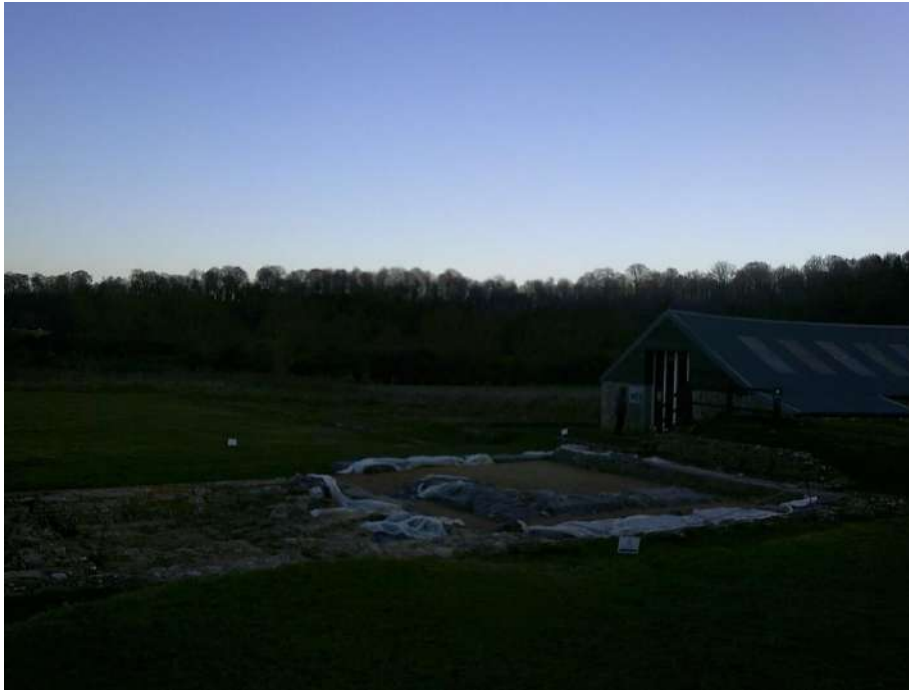
Fig. 9 a, b, c. The same building on the 20th of January 2025; photo EED-V.

The mosaic ( fig. 7 a, b ), on which I have particularly focused my research at North Leigh Villa since this medium is central to my long-time professional interest, underwent major maintenance work in 1929, when it was lifted and treated; reconstruction of the floor was carried out in 2023, fig. 10 shows that activity was in progress at that time. In January 2025, when I visited the place for the third time, I could see that further work on the mosaic is being carried out; fig. 11 a, b, c, d, e .