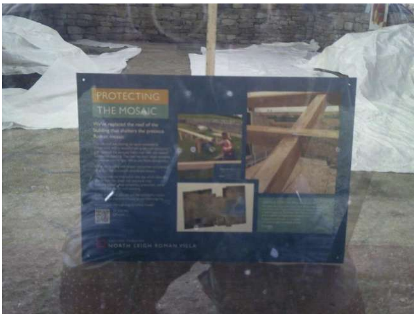
Fig. 11 a. The work for the protection and conservation of the pavement mosaic at the North Leigh Roman Villa; photo EED-V, 20 th January 2025.