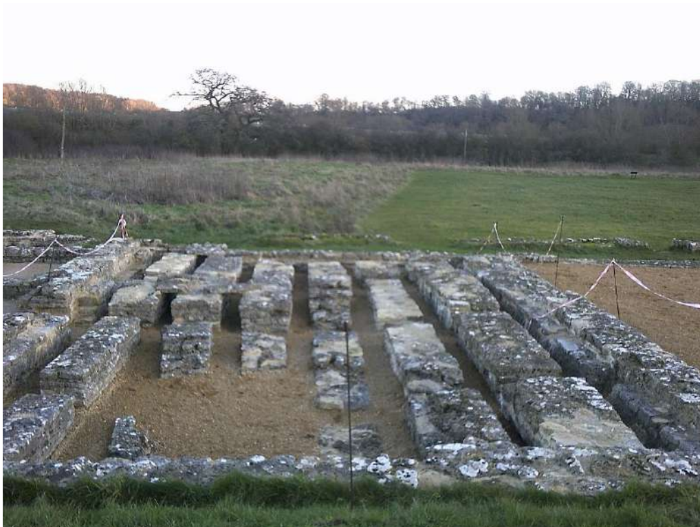
Fig. 6 b. Remains from the villa in November 2023; photo EED-V, 20th November 2024.