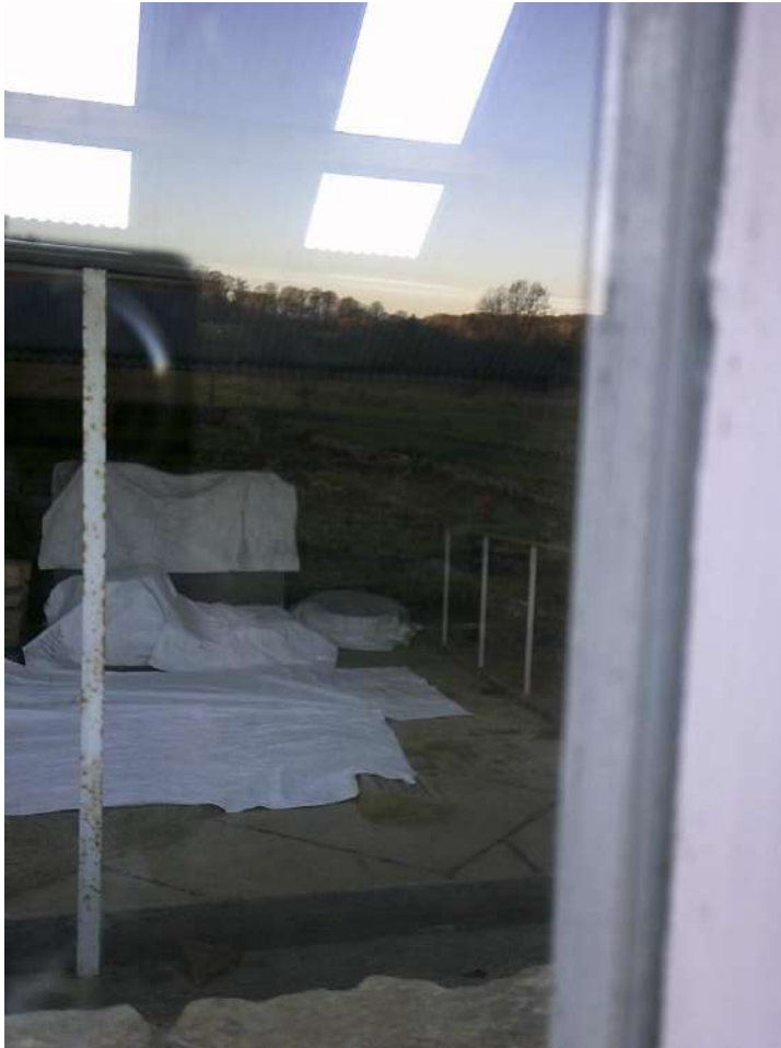
Fig. 11 c. The work for the protection and conservation of the pavement mosaic at the North Leigh Roman Villa; photo EED-V, 20 th January 2025.