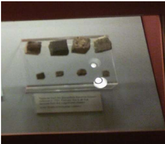
Fig. 4. Tesserae from the mosaic pavement discovered in 1712 at Stonefield. Museum of Oxfordshire, Woodstock; photo EED-V, 20th November 2024.

Margerie Venables Taylor summarized a part of the controversy; she personally believed these to be the remnants of a house that belonged to a local that lived during the Roman occupation. 11 A few tesserae from the pavement discovered at Stonefield are today within the Museum of Oxfordshire, Woodstock, UK, fig. 4 .