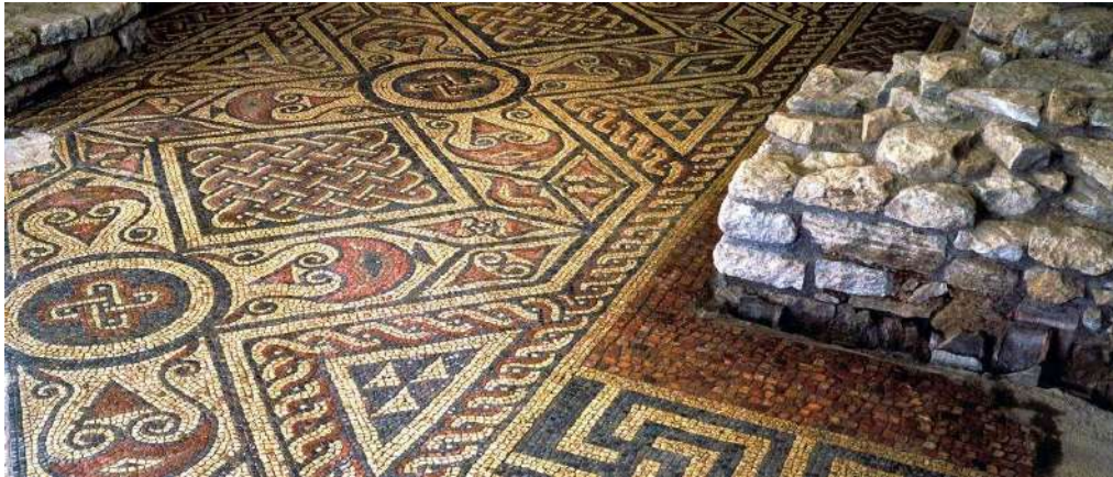
Fig. 7 b. The mosaics at North Leigh Villa. Photo with the colours enhanced (photoshoped?) by the English Heritage. Source: North Leigh Roman Villa | English Heritage

Today the piece is hosted by a large solid shed built for this purpose initially by the Duke of Marlborough in 1816 and renovated from time to time since, fig. 8 (2023).