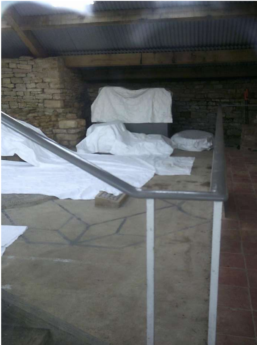
Fig. 11 d. The work for the protection and conservation of the pavement mosaic at the North Leigh Roman Villa; photo, 20 th January 2025.