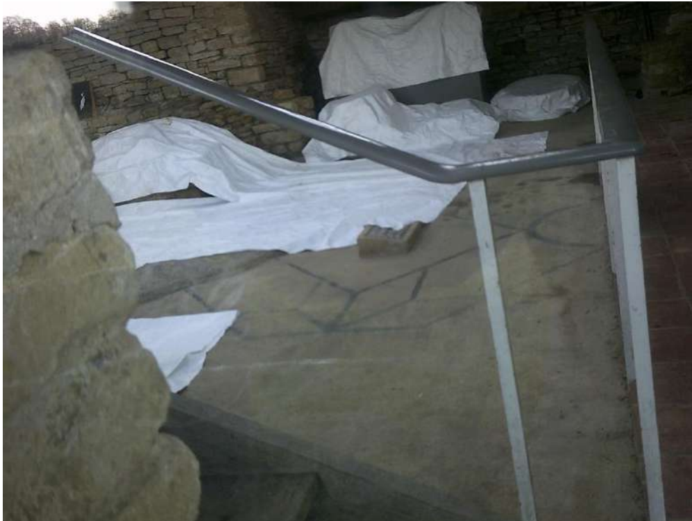
Fig. 11e. The current conservation work on the mosaic at the North Leigh Roman Villa; photo EED-V, 20 th January 2025

The surviving mosaic at North Leigh Villa is made of red, grey-blue, and white tesserae. The colours have faded, especially those on the tesserae in red. Conservation work is needed for the mosaic to regain its original shades and for the missing tesserae to be replaced by new ones. (Complex technical issues are involved in the latter since the composition of the original material and the technique involved in producing the new tesserae might not be identical to those used by the initial masters who decorated the villa).