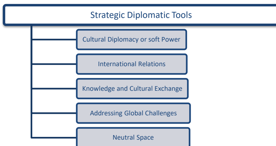
Fig 1: Strategic diplomatic tools

Libraries are an aid to soft power of any country by promoting its culture, language, and values. They help to shape international perceptions and build a positive image of the country (Byrne, 2007; Laugesen, 2019; Lor, 2019). Through soft diplomacy, countries exert and enhance their influence and credibility on the global stage. Most of the countries run exchange programmes with other countries and have set up institutes and centres. “China has used the Confucius Institutes as a tool for its foreign policy and diplomacy (Shivam Kumar, 2024). Libraries address global challenges such as information warfare, disinformation, and unequal access to information.